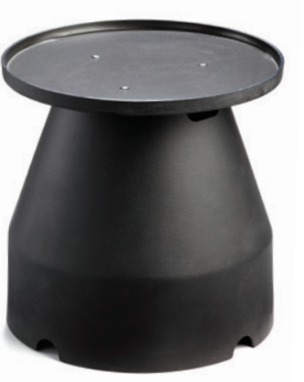
OPTIONAL COVER FOR FP2085 FP20COV Table Top Cover (Conveniently Covers Up Propane Tank When Fire Pit Is In Use).