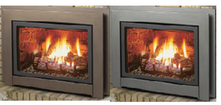
The Marquis Capella shown in Copper Vein & Pewter Finishes

For a starting list price of just $2129 (for the body, rocks, rock support platform, black clean view kit and black surround), the Capella Direct Vent Insert is a beautiful, affordable way to enhance your home and create a warm and inviting atmosphere. Ask for details.