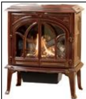
IPI Allagash with a P4 of 66.6%

Now in stock from Northwest Stoves, The GF300 DV Allagash with Intermittent Pilot Ignition. A new twist on a classic stove.