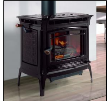
Manchester in Brown Enamel

Along with the Shelburne (medium) and Craftsbury (small) stoves, the Manchester completes Hearthstone's unique offerings of the beauty and versatility of cast iron in combina-