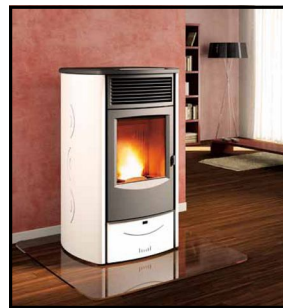
Piazzetta's Sabrina Stove in White

so ask your rep for details. Pricing for the Piazzetta is very competitive for such a fantastic stove as well. The Monia retails for just $2899 and the Sabrina for $3199. The Marcella lists at $3598 and the Sveva at $4198. You can also add an optional $99 remote to these units as well. The P960 retails with the remote included for $5798.