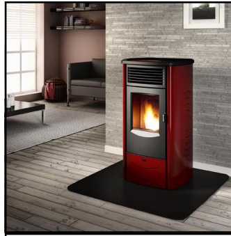
Monia Pellet Stove in Bordeaux

The blowers are made by either SIT or EBM. All of the motherboards are the same for each unit, with different software and firmware loaded on each unit. Everything is easy to access, clean and maintain.