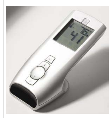
Kingsman/Marquis GTMRCN modulating remote control