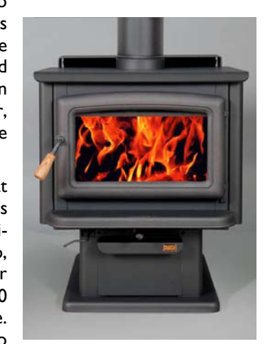
PE's Limited Edition Heritage

The first shipment of these will be arriving at Northwest Stoves in a couple of weeks, so order soon. Remember that there will only be a limited production on this stove, so if you wait too long, you may be out of luck.