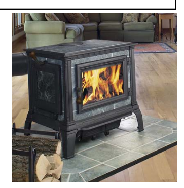
Now available, the Equinox can comfortably heat up to 3500 square feet

With a burn time up to 12 hours, and a heat life of up to 16 hours, the Equinox has an 8" flue collar with the ability to be either free-standing or hearth mounted.