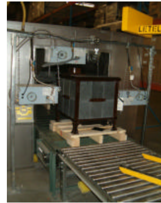
A Mansfield stove begins the voyage through HearthStone's new heating tunnel.

The tunnel is just one of several changes that HearthStone has made to ensure their product's quality is among the best in the industry. While in Vermont for the annual winter meetings, Northwest staff were all duly impressed with the rigors a stove must go through to pass.