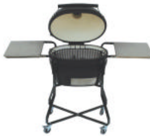
The Junior in a Cradle with Stainless Steel Shelves

"The best sized and only oval shaped grills in the ceramic universe"