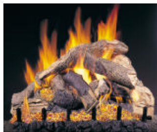
Peterson's Sierra Log Set with the Flat Pan Burner (FPB)

All boards will soon be produced with Thermoshield protection, with a tested R Value of 1.01. Another product to soon be available is the Guardian powder coated black stove board, made from the same material as the Thermoshield board. With an R Value of 0.66, it will be available in two sizes when ready this summer.