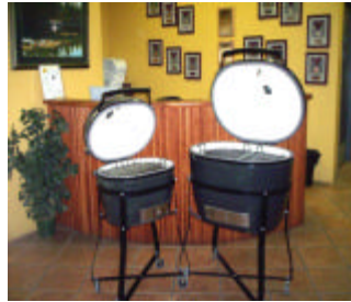
Primo Grills and Smokers presents the Junior and the Oval

The Junior is available now, so call us to make it part of your BBQ lineup today!