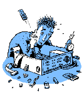
Greg attempts to repair the last Convair Cooler of the summer season