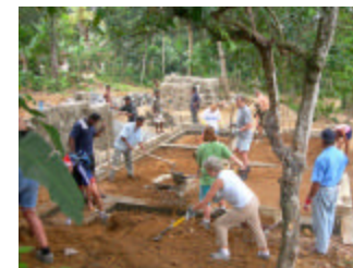
Site where W.O.R.K. is constructing six houses

Sri Lankans. Brent and his energetic team of volunteers have raised over $50,000 which has been used to buy property in Sri Lanka, materials for houses and to hire a Sri Lankan labour force to assist in construction.