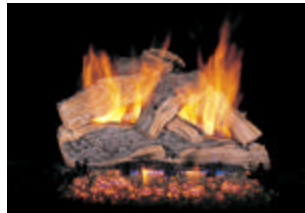
Rugged Split Oak