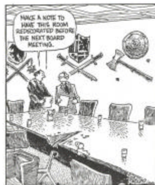
Typical "productive" meeting at Northwest Stoves