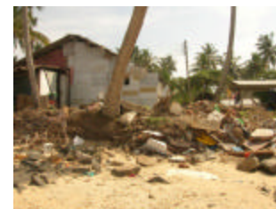
Typical wreckage found along Sri Lankan coast

Local group true heroes In the aftermath of the devastating earthquake and tsunami that ravaged the coastal areas of South East Asia and Africa on December 26, 2004, many of the victims remain in deplorable living conditions. Unfurnished tents and wooden shacks, often erected on the foundations of destroyed homes, are common. The damage is so widespread, most of us cannot comprehend the brutal reality faced by the millions of affected people.