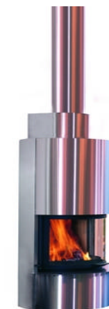
DSA 5 woodstove

Some of the Scan woodstove features include; a built-in a ceramic smoke deflector system which provides excellent fuel consumption, an optional glass baking door (available on most stoves), and a large viewing area of the fire with an effective air supply system to keep the glass clean. It's no wonder they call their stoves "warm furniture." For more information, visit us at northweststoves.ca .