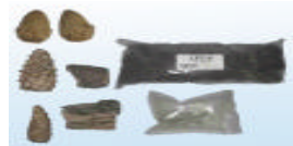
Décor Pack (DP-7)

Also from RH Peterson is the Décor pack (DP-7). This pack consists of Bryte Coals, Lava Fyre Coals (6 lbs.), Wood