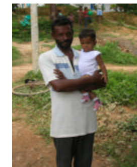
Happy new home owner with his daughter