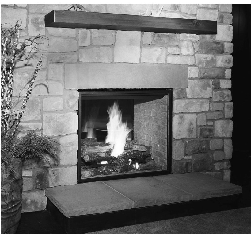
TOWN & COUNTRY'S SEE-THRU FIREPLACE LOOK AND BURN LIKE A REAL WOOD FIRE

Some fireplace manufacturers have had to compromise with tiered burners or stepped logsets to achieve the look of a full flame. Town & Country's patent-pending "Decorative Direct Vent" technology has revolutionized the way gas fireplaces are built. The result: a seethrough gas fireplace that retains the look of a masonry fireplace. It has a flush hearth, a larger, more spacious view, and more robust