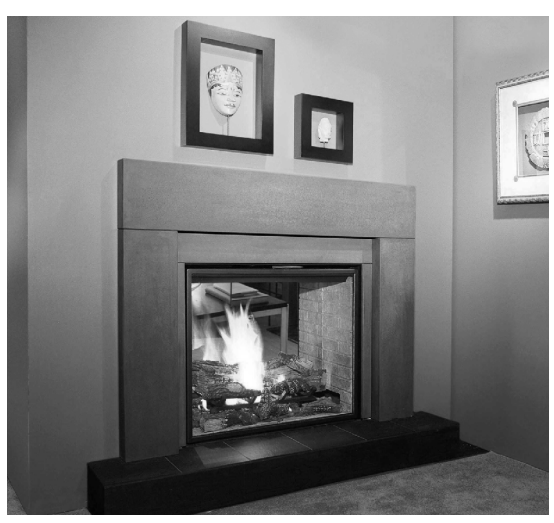
{\tt DDV}\,{\tt TECHNOLOGY}\,{\tt DELIVERS}\,\,{\tt MORE}\,\,{\tt ROBUST}\,\,{\tt FLAMES}