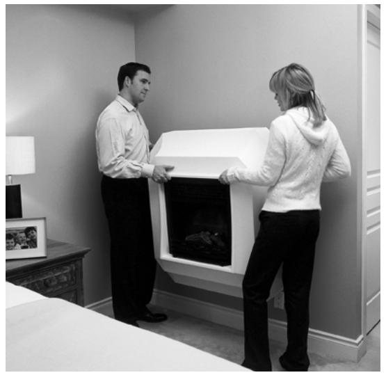
FORMGLAS FIREPLACES ARE LIGHT-WEIGHT AND EASY TO INSTALL

"I find it rather easy to portray a businessman. Being bland, rather cruel and incompetent comes naturally to me.