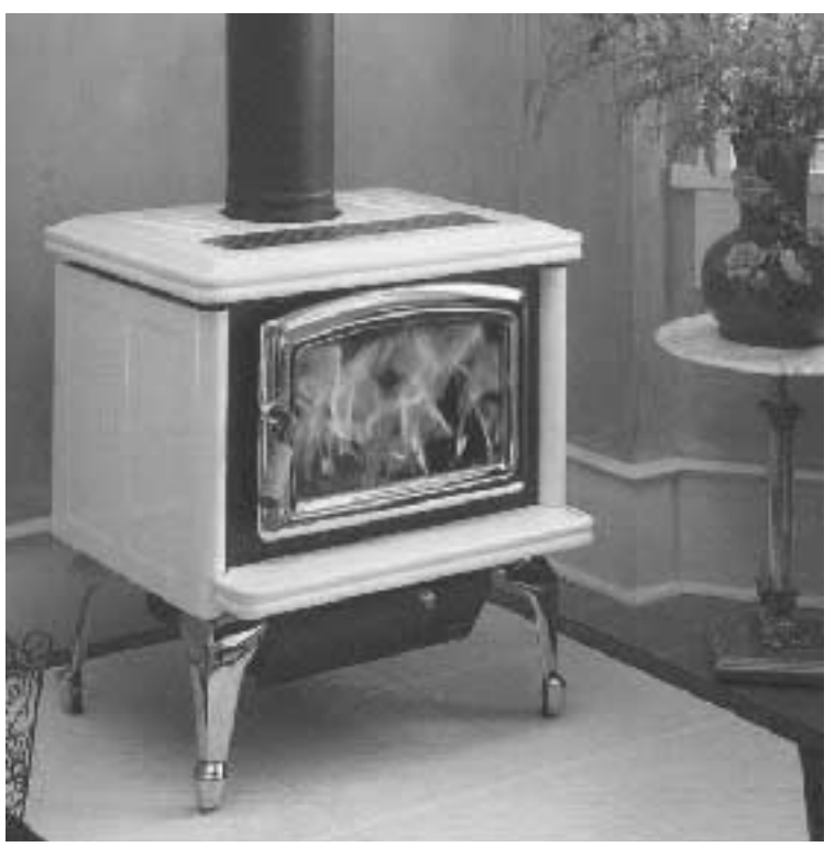
NEW VISTA CLASSIC