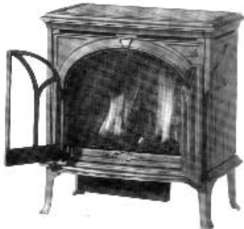
NEW LILLIHAMMER WITH DOORS AND STANDARD SHORT LEGS. AVAILABLE FALL 2004.

A small change has helped improve the appearance of the popular Firelight and the 3CB stoves: They have removed the horizontal bars from the doors,