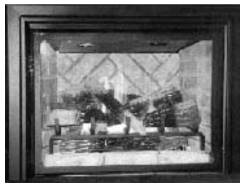
NEW MAX DIRECT VENT INSERT FROM PACIFIC ENERGY

Also shown was the prototype Fusion wood stove. This unit, based on the Super 27 firebox, has a more European inspired design, and generated a lot of interest and comments.