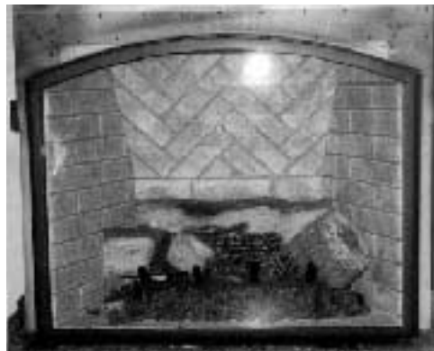
NEW TOWN AND COUNTRY 36 ARCH

The TC42 will be manufactured with a shorter box – same size firebox and same big flame, but a 16 inch shorter unit and lower mantle clearances. The TC42 was also shown with porcelain black panels, which