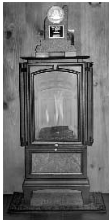
HEARTHSTONE'S TUDOR WITH DOORS FOLDED BACK AGAINST THE SIDES. ON TOP SITS THE VESTA AWARD.

Up until now the Morgan fireplace insert was the only non-catalytic cast iron wood-burning insert on the market. Now there is another larger ver-