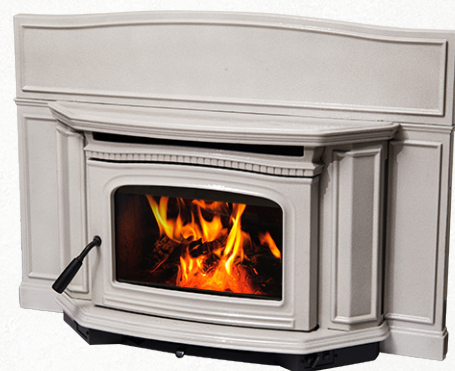
ALDERLEA T5 CLASSIC