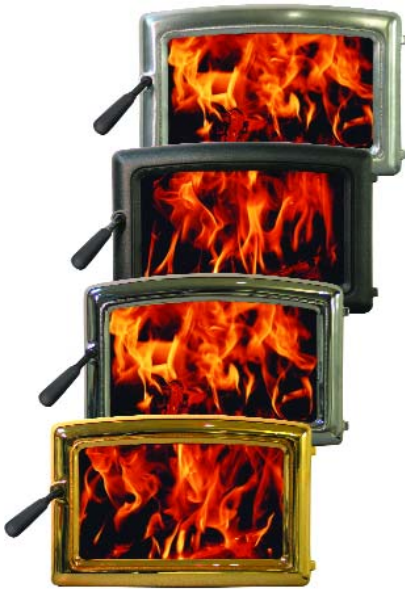
Arched doors are available in Gold, Nickel, Metallic Black or Brushed Nickel.

Traditional good looks and efficient heating in a smaller package. The Vista's craftsmanship will stand the test of time and deliver years of heating comfort in your home.