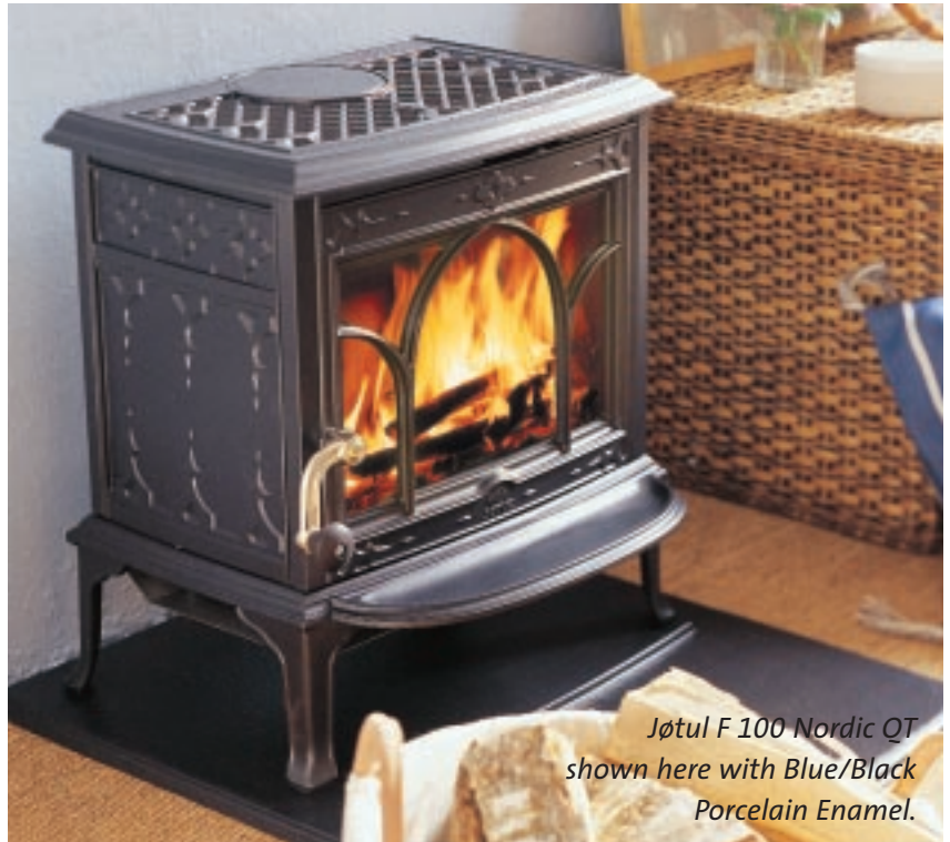
Jøtul F 100 Nordic QT shown here with Blue/Black Porcelain Enamel.