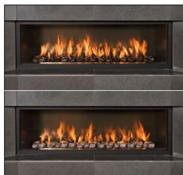
Town & Country's Metropolitan Rock Sets take your Wide Screen from Zen to Zen Glamour

TC38 Wide Screen & the TC54 Wide Screen.