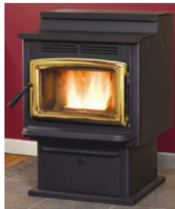
Warmland Pellet Stove

Much like a Pacific Energy Woodstove, you can also choose between a leg or a pedestal model for your Warmland , and all of it is backed by a limited five year warranty.