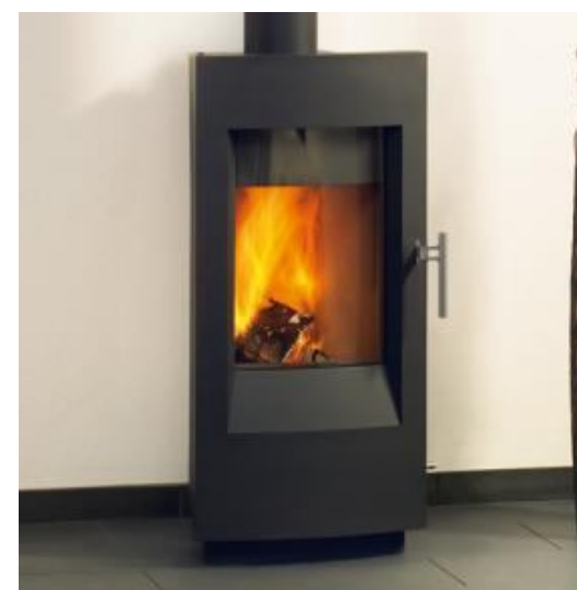
Hase's Tula Wood Stove in Charcoal

dering now at Northwest Stoves in 2 different colours—Charcoal and Umbra Brown. The suggested list price for either one is $4399.00.