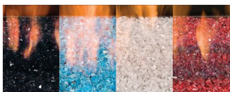
Town & Country's New Black Diamond Glass Colours

Now you can change the look of your Town & Country Black Diamond burner by changing the colour of the tumbled glass. Four varieties are available and they are (from left to right below): Black Diamond, Sky Diamond, Ice Diamond and Fire