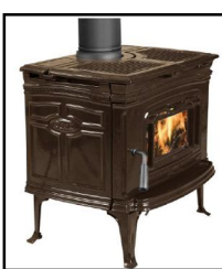
Majolica Brown T4 Classic

Now available and ready for orders, the Alderlea T4 Classic Wood Stove.