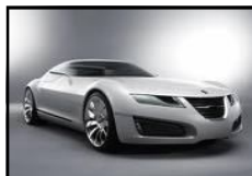
Brand New Saab

Here is an example. You're off to buy a car and make your way to the local Saab dealership where you're greeted at the door. The salesman asks you what your budget is. Because you're unsure what a Saab will run you, you tell him $10,000. He proceeds to show you the Hyundai Sonata he took in on a trade.