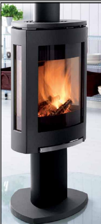
Jotul's F370 provides a beautiful, contemporary look for wood

Ask us about the new 'clean face' option on the F500 Oslo.