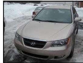
Hot Times Editor's Hyundai Sonata (see article at right for more information)

Phone: (604)857-8816 Toll Free:1-800-663-0462 Fax:(604)857-8963 Toll Free Fax:1-800-667-6162