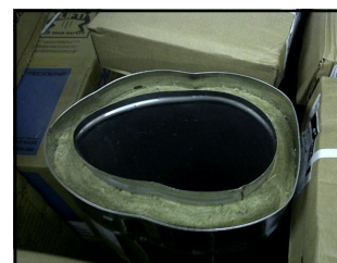
Damaged length of Excel Chimney, shipped via courier