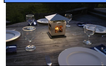
New Joi Light by Caframo