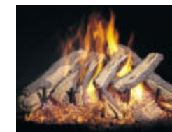
Western Campfire Logset