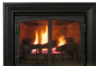
Broadway with screen door

The introduction of a new 2 1/2" Black Metallic Spacer means The Broadway is now the perfect DV