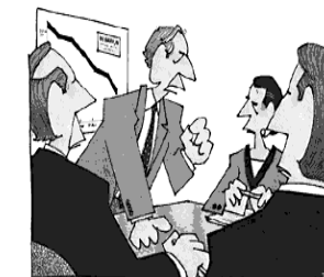
"Our employees are our greatest asset. I say we sell them." AHAJOKES.COM

Northwest Stoves Strategic Planning Seminar Goes Awry