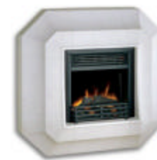
Malibu—Limestone wall mounted fireplace