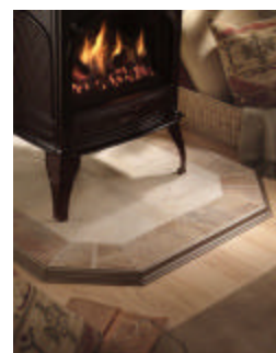
Sonora-Siena board with Classic Edge Trim

Northwest Stoves now. Other colours that are no longer available include Light Brown (possible sub: - Sonora), Tartara (possible sub: D'Africa), Almond (possible sub: D'Africa), and Mojave (replaced by Travertine—see your rep for the sample of this new colour). Call for availability.