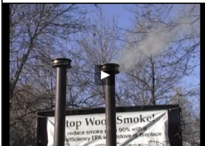
Excerpt from "Advanced Wood Stove Technology" video comparing stoves

In our industry, we are always looking for simple and effective ways to educate the consumer to the do's and don'ts of wood burning. However, we rarely come across anything that isn't either (a) highly technical and difficult to comprehend by the average consumer, or (b) poorly made and not worth the