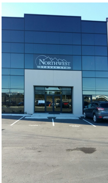
Northwest Stoves Abbotsford Location