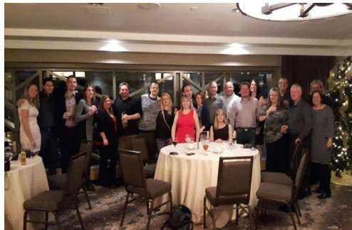
NWS 2016 Christmas Party

From all of us at Northwest Stoves we wish you a happy and healthy end to 2016 and all the best for a prosperous new year.