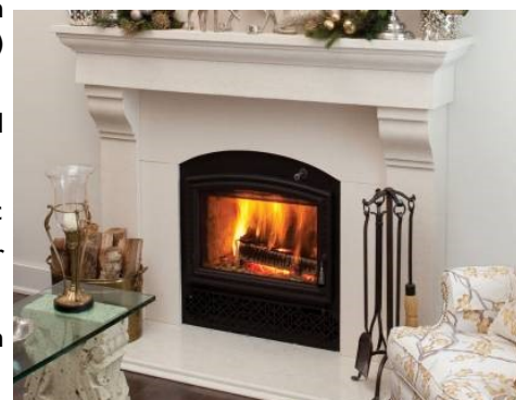
Opel 3 Catalytic

Please contact your sales rep for further information.