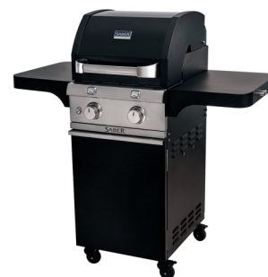
Cast 330 P

Introducing the new Saber Cast Series gas grills featuring three full size free standing gas grills including a new urban sized two burner grill. The cast series grills have an enclosed, easy assemble cart with a sleek on-trend black powder-coated finish and commercial grade stainless steel control panels and handles. The grills feature grate level temperature gauges and a push button electronic ignition system with electrodes at each burner. The Saber Cast grills have the same patented high performance infrared cooking system and all the performance features as existing Saber products, including stainless steel cooking grates, burners and emitters, adjustable warming racks, high strength side shelves and front access grease trays. The Saber Cast 330 P two burner grill has 445 total sq. in. of cooking surface and is priced at $999 MSRP.