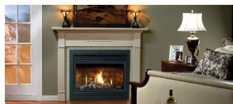
Solara ZCV3622 $1440.00 retail

Also new from Marquis is the Enerchoice approved ZCV Skyline ZCVRB3622. Both models are in stock at NWS now.