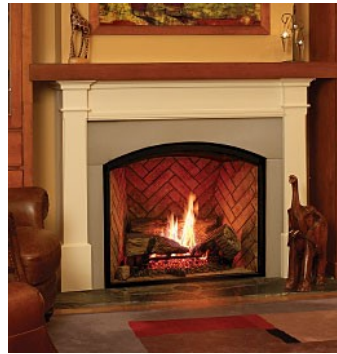
T&C 36 Arch

has been “beefed up” to reduce possible damage to the wires during the moving of the unit.