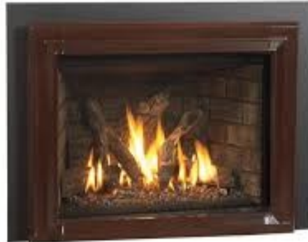
Jøtul's New Harbor Insert

Introducing the Jøtul New Harbor Gas Insert, Inspired by the coastal town of New Harbor Maine this direct vent, IPI, dual ceramic burner combines time honoured craftsmanship with modern design. This modern classic design insert is a perfect fit for any medium sized fireplace and features electronic ignition, battery backup, multifunction proflame 2 remote with flame control, blower fan and top firing accent lights.