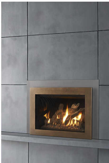
Jøtul GI 635 DV IPI

Revolutionary new dual ceramic JøtulBurner, up to 64% heat control turn down, blower kit (120 CFM remote controlled with 6 level illumination, multifunction Proflame 2 remote with flame modulation control, Top firing accent light kit (remote controlled with 6-level illumination).