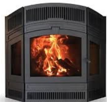
RSF Delta Fusion

Whether you are new to wood burning or not you will appreciate the easy operation of the Fusion. It is as simple as filling with wood and kindling, light the match close the door and watch the big beautiful flames. With the Fusion you get a consistent beautiful, environmentally friendly fire with no black glass or dirty chimney. The clean burn is achieved with lots of secondary combustion which happens when the fire is most visually appealing. The Delta Fusion is in stock and retails for $4995.