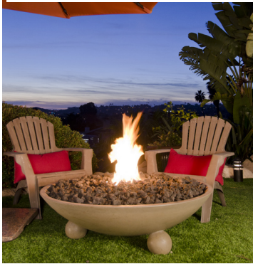
Versailles 48" Fire Bowl