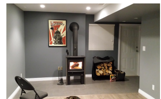
Neo 1.6 in Clint's home