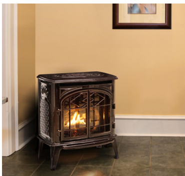
Trenton in Majolica Brown

Coming soon from Pacific Energy, the Trenton Gas Stove is an exceptional performer with classic good looks. Heavy cast iron radiates the heat evenly from the top and sides of the stove, providing constant heat throughout the room. Decorative doors swing open to reveal an unobstructed window of the rich, full flames and stacked logset. The fire is even further reflected across the lustrous porcelain black panels that line the interior of the firebox and enhancing the flames.