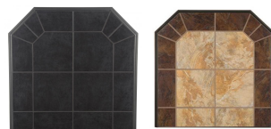
Olympic Gray Desert Canyon