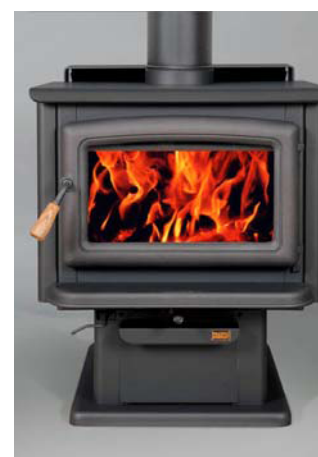
PE's Limited Edition Heritage

The first shipment of these will be arriving at Northwest Stoves in a couple of weeks, so order soon. Remember that there will only be a limited production on this stove, so if you wait too long, you may be out of luck.