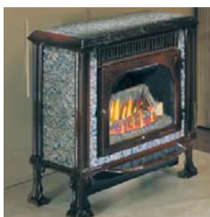
Hearthstone's Sterling B Vent Stove