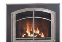
GI350 (or Scan 65i) shown here with Arch Steel Doors

Please contact us if you require labels for any of the above products or any gas units which Northwest Stoves supplies you.