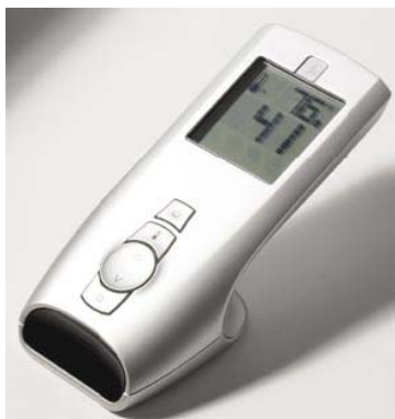
Kingsman/Marquis GTMRCN modulating remote control