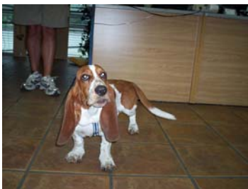
What happens when we let Wayne do the hiring

Please refer to pages 62 & 63 in your Maintenance section for further details.