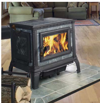
Now available, the Equinox can comfortably heat up to 3500 square feet

With a burn time up to 12 hours, and a heat life of up to 16 hours, the Equinox has an 8" flue collar with the ability to be either free-standing or hearth mounted.