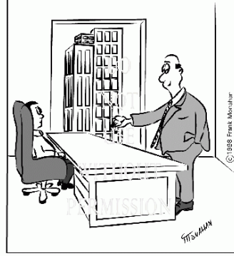
"Look at this empty desk! No computer. No phone. Not even a pencil. When did you get promoted to Vice President?"