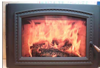
RSF's new Opel 3 display

The new gravity vent kit (FOV-2) uses an adapter to work on all RSF's except the Oracle.