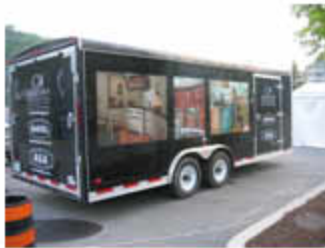
Heartland/AGA had their trailer parked at the Summit