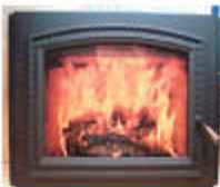
New Opel3 Display

The new Opel 3 is available now in a black door model. If you wish to display the Opel 3 and the Opel 2 but don't have