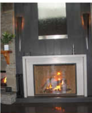
TC54 seen in the front entrance as you walk in. That's a waterfall above the Town & Country.

One of the most impressive aspects of the experience is the nine plasma televisions scattered strategically among the fireplace & stove lines. Each TV features numerous still photos put together to make a Product Showcase Video. This enables the consumer to physically see other options for different fireplace lines that may not appear on the showroom floor. I'm sure that this idea is the way of the future in this industry. After all, what dealer hasn't wished they had more room to display a wider range of products?