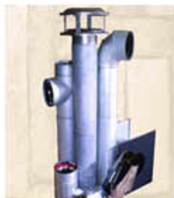
Excelpellet will make your installs go much smoother

And even though the clearance to combustibles for Excelpellet is a paltry 2", it will soon be available with only a 1" clearance to combustibles .