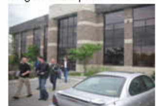
"The gang" heads out from the state of the art Winnipeg fac-

There's no question that each of the dealers who show Kingsman/Marquis units are