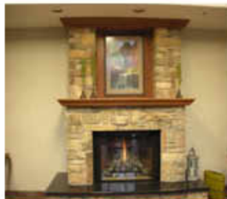
Clean face unit seen in front entrance of Kingsman's factory

Another new item is a rock set for the IDV33 Insert to complement the rocks already available in the Marquis Collection.