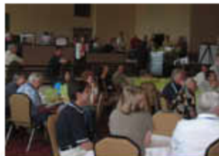
The summit presentations were well attended

The number of outdoor boilers currently in existence was a shock to the