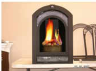
Soon to be coming from Kingsman—The Marquis Serenity