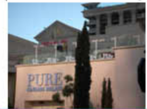
Infratech Heaters at Las Vegas' famed Caesar's Palace.