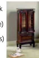
Tudor Brown Enamel