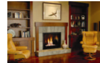
TC42 with Tranquility Burner

- The Tranquility Burner is now available for ordering for the TC30, TC42 and all TC36 models. It is a very contemporary style that has become very popular with designers.