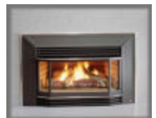
Granville DV Insert

* Each list price is for body only. Components are extra and are available on a first come first served basis until gone.