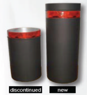
New, Taller Round Support

- Once Northwest Stoves' inventory is depleted, the Firestop will be discontinued. When going through a floor or a ceiling you must use a radiation shield - The Round Support is now 24" tall. This allows the support to fit steeper pitched ceilings without an extension and, more importantly, provides additional protection from insulation in the attic