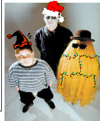
My brothers and me. I'm the one on the right.

Whichever way you choose to celebrate the holidays, make sure you take some time to rest after another stressful fireplace season. Take a breath, sit back and relax. You deserve it. Happy Holidays from all of us at Northwest Stoves!