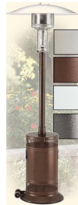
Propane Heater in Antique Bronze. It is also available in Stainless Steel, Jet Silver Vein or White.

Introducing the newest member of Northwest Stoves Infrared Patio Heater family, the Patio Comfort heaters. All Patio Comfort Heaters are designed with long-term durability and performance in mind. Each of the painted heaters are "powder coated" for added durability and most major components and fasteners used in the stainless steel heaters are made from commercial grade "Series 304" stainless steel or brass.