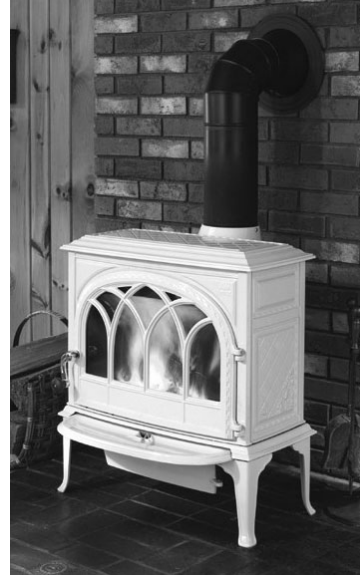
NEW JOTUL SINGLE DOOR CASTINE

With today's high-tech stoves, the chimney is the MOST CRITICAL component of the system. The chimney is the engine that drives the car. It is the heat in the chimney that creates the draft and makes the stove work. It is NOT the stove that makes the chimney work.