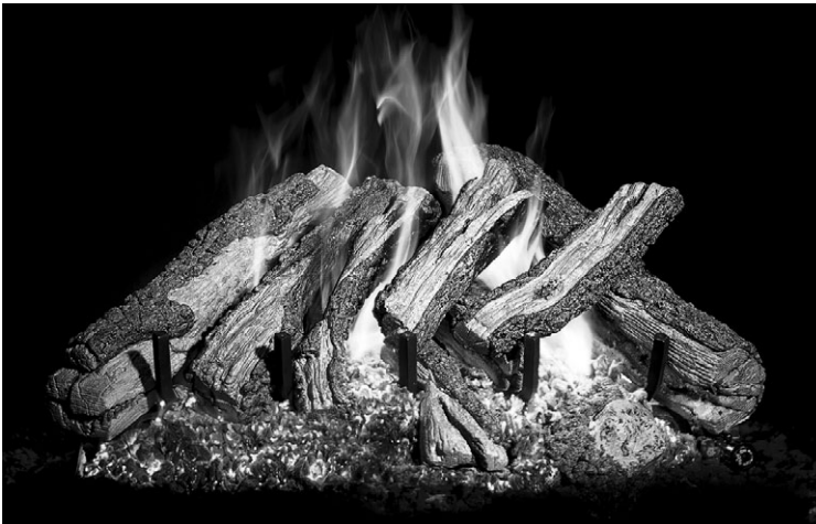
PETERSON'S WESTERN CAMP-FYRE LOG SET

Log sets add to a room's decor and create a comfortable ambience on those chilly Fall and Winter evenings.