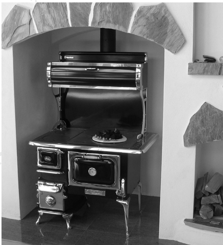
HEARTLAND'S WOODBURNING OVAL COOKSTOVE: INSTALL AND PHOTO BY RICK AND RHONDA FRIESEN, CRANBROOK'S FIRE PLACE.

A new feature has been added to the Metro/Legacy convection mode. You can now turn the bottom element on during convection for a more intense heat at the bottom of the oven; perfect for that flaky pastry or great tasting pizza.